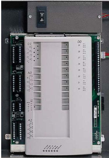
Figure 2. Raptor Controller